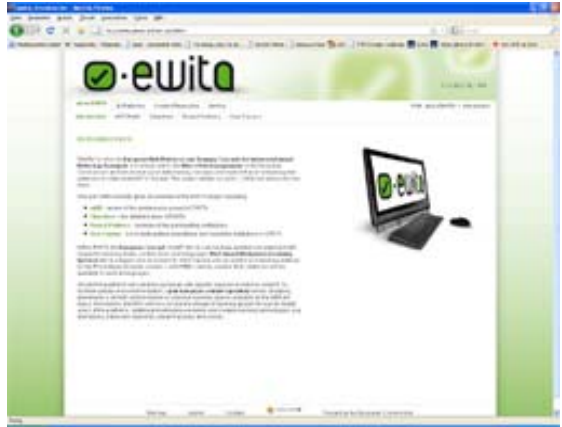
Figure 1: Screenshot EWITA Website

INeS Danube and INeS RMS shall be launched in the first quarter of 2010.