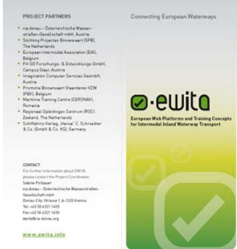
Figure 2: EWITA Leaflet

It can be downloaded at www.ewita.info or ordered at ewita@ewita.info .